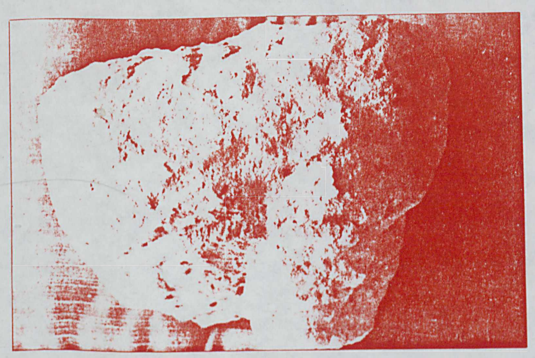
b. Forepart of a Ram's Body. Salamis, Storeroom of the Excavation House.