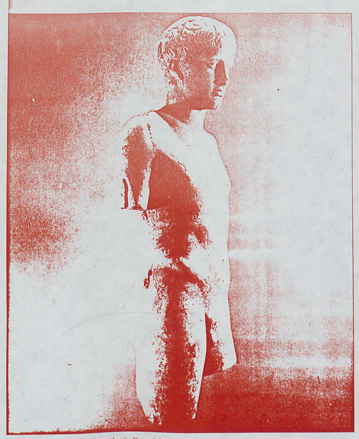
Polyklestan Youth. Pittsburgh, Pennsylvania, Carnegie Institute, Museum of Art.