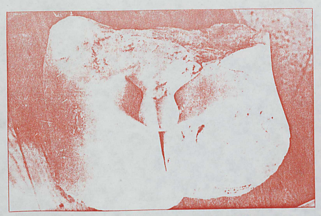
a. Lower Body of a Young God or Hero. Salamis, Storeroom of the Excavation House.