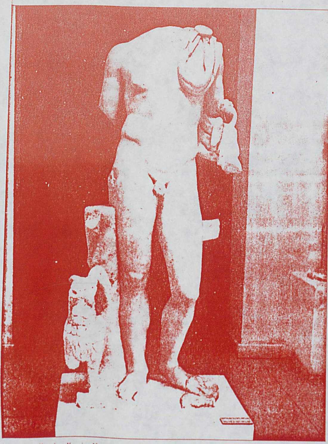
Iermes from Kourion. Kourion House (Episkopi) Museum.