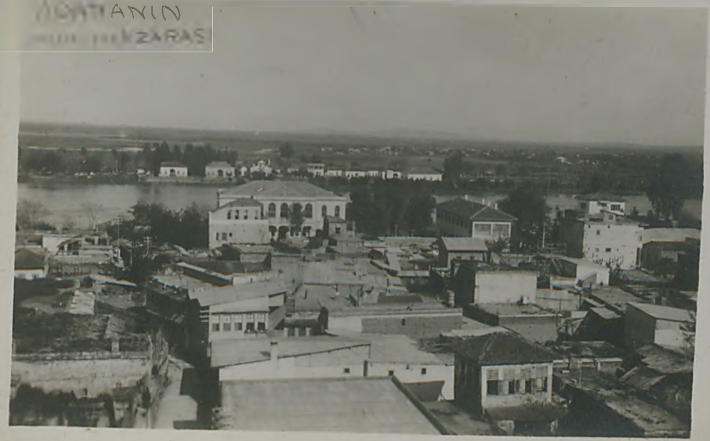
ADRIANIN with KAZARAS